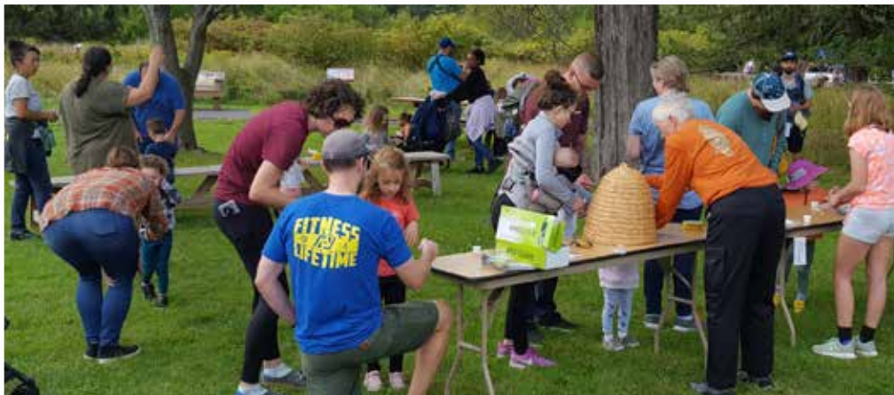
Family fun games on a beautiful Fall Festival day.